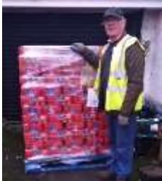
Mackle Pet foods