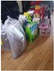
Paws It Forward, Rose, Bear & Bonnie