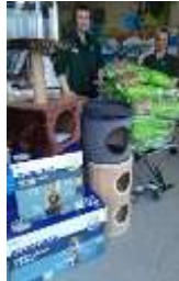
Pets At Home VIP